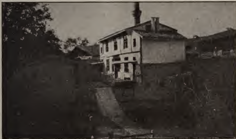
THE KING SCHOOL FOR THE DEAF, MARSOVAN

From the east windows of the hospital room in South Hall there is a beautiful view across the red roofs of the city straggling down the hill, and over the wide plain to beautiful old Ak Dagh, the highest peak in this part of the country. From the southern windows one has a fine view of the